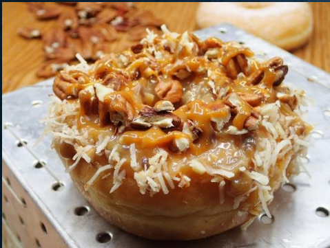
Caramel & Pecan Donut