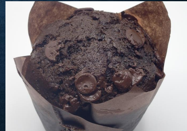
Double Chocolate Muffin