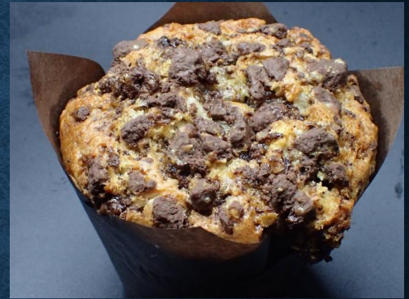
Chocolate Chip Muffin