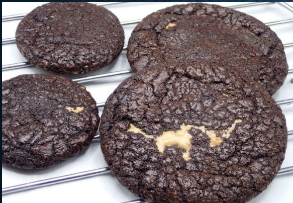
Chocolate & Peanut Butter