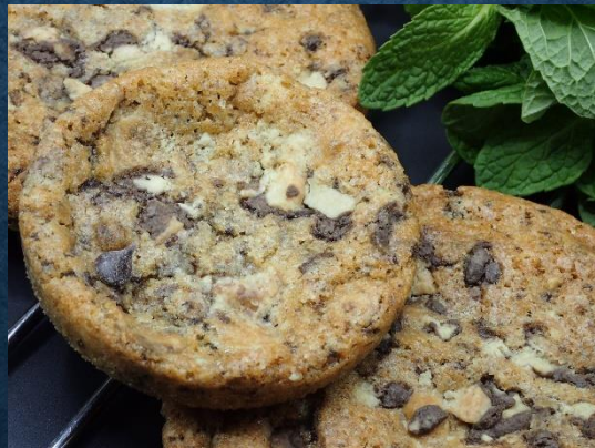
Chocolate & Mint