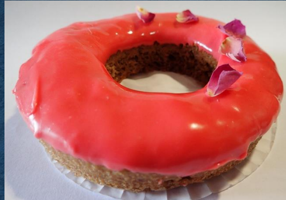
Rose & Pistachio Donut