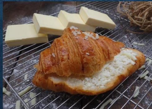
Cheese filled Croissant