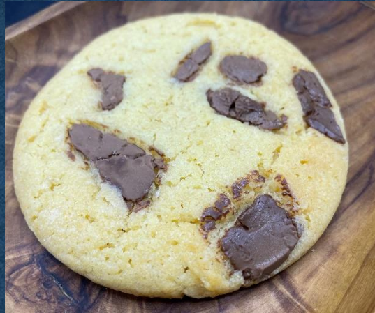
Sugar free Chocolate