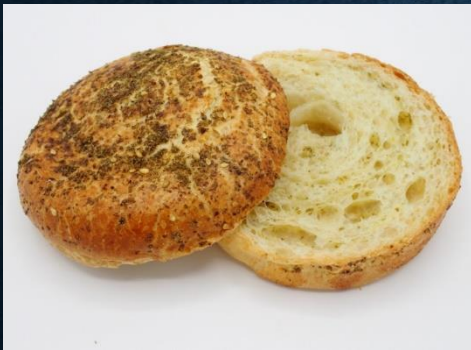
Croissant Zaatar Round Shape