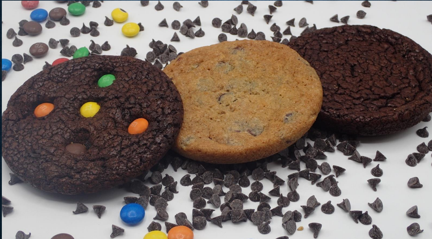
M & M – Chocolate Chip – Double Chocolate Cookie