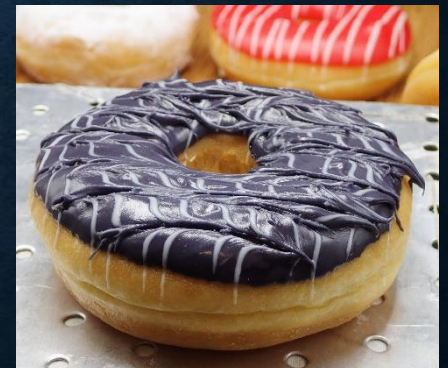
Dark & White Chocolate