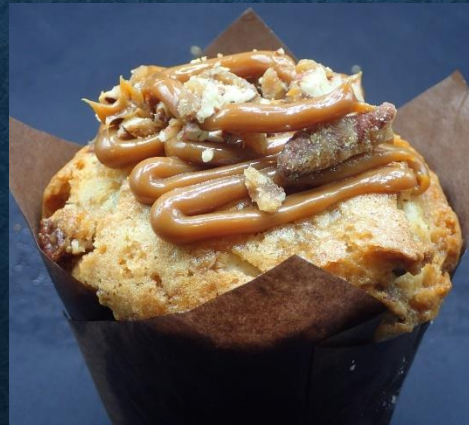
Pecan & Caramel Muffin