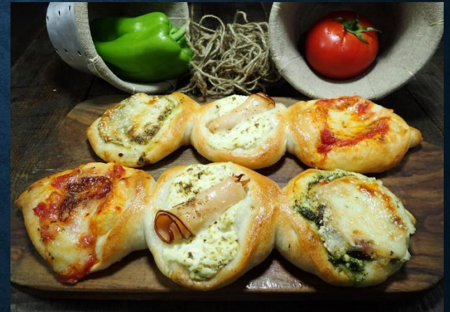
Pizza Stangerl 3 Kind