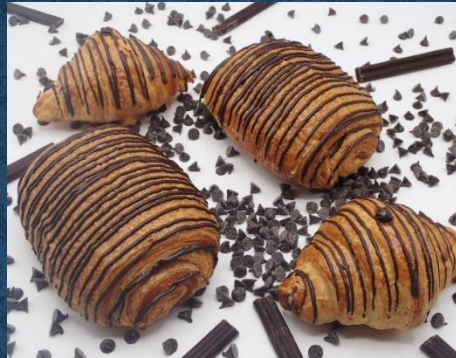
Pain au Chocolate