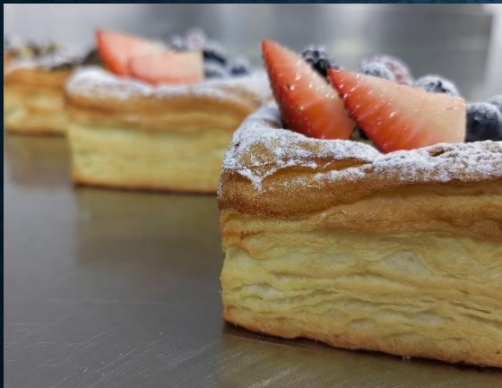
Croissant Square – Fresh Forest Berries

Always a great treat with a hot beverage at breakfast or an afternoon tea